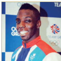
TABLE TENNIS DARIUS KNIGHT Seven-time British table tennis champion

COASTAL ROWING GIACOMO GENTILI Olympic Medalist 🏅🏅